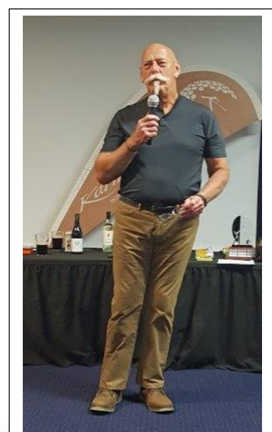
Our Captain Looking Good